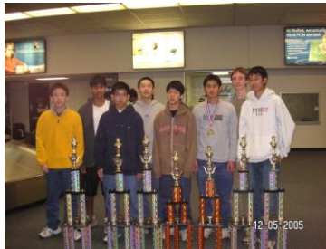
Saratoga High School team